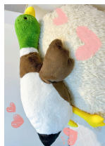
40" Plush Duck