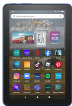
Amazon Fire 8" Tablet