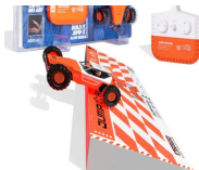
JumpRover RC Car