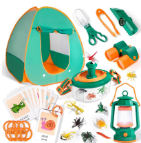
Pop Up Play Tent