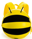
Mini Bumblebee Backpack