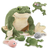
Stuffed Frog w/Babies