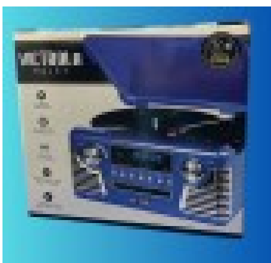
Victrola Bluetooth Turntable