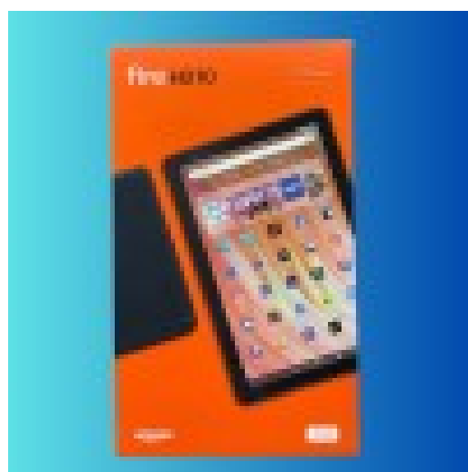
Fire Tablet HD 10