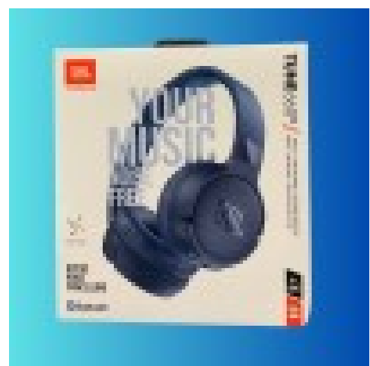
Bluetooth Noise Cancelling